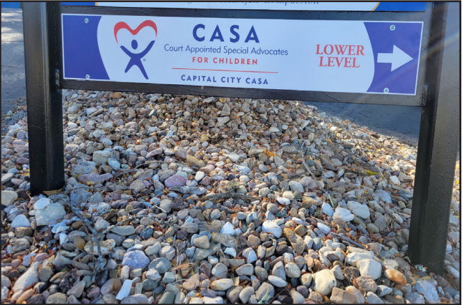
Capital City CASA moved to its new location at 600 Monroe Street, Suite 100 in Jefferson City.