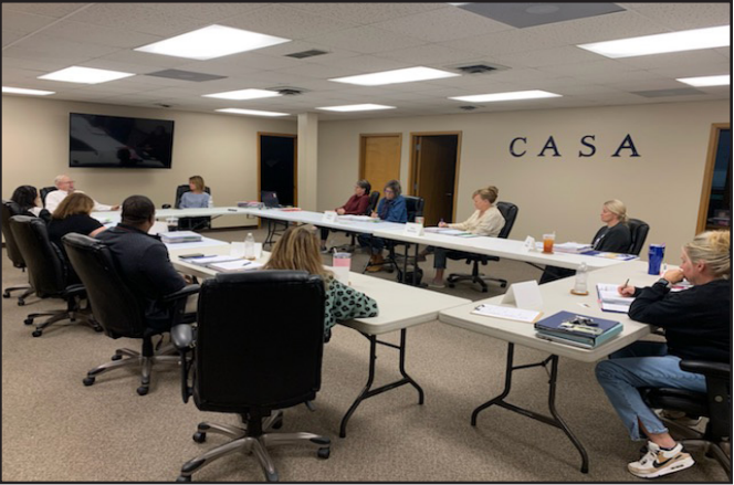
Capital City CASA uses its new facility to host a volunteer training for advocates.